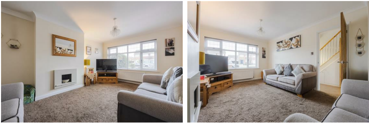
Lounge 15'9" x 10'8" (4.82m x 3.26m)