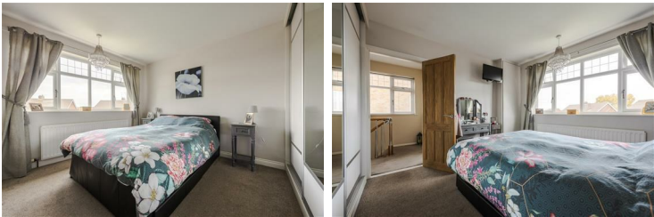
Bedroom one 10'8" x 10'8" (3.26m x 3.26m )