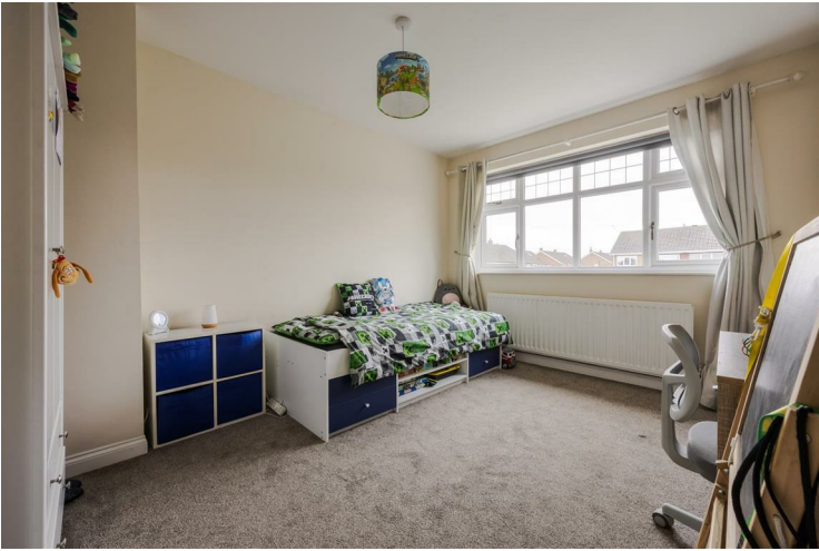
Bedroom two 12'9" x 10'8" (3.90m x 3.26m)