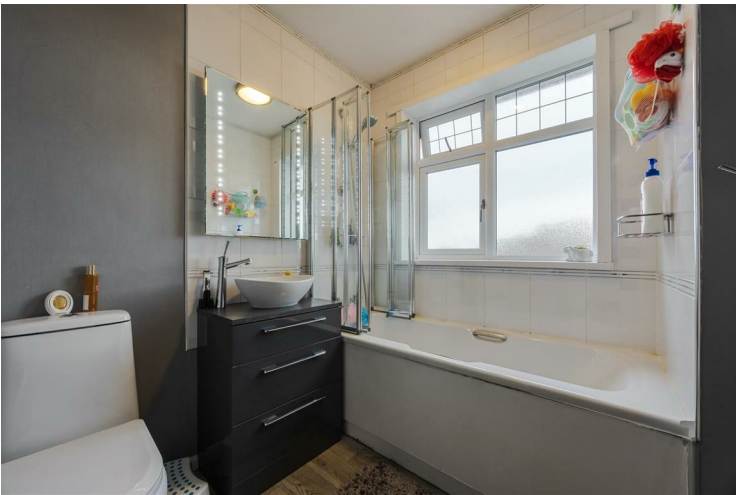
Bathroom 6'11" x 6'8" (2.11m x 2.05m)