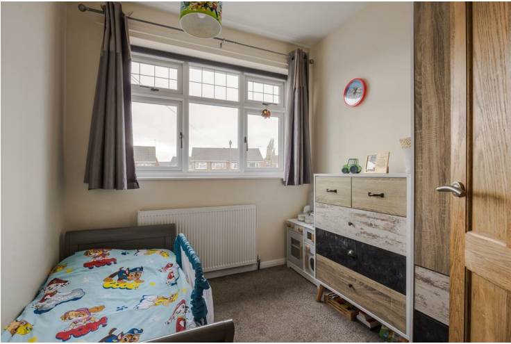
Bedroom three 7'11" x 7'10" (2.43m x 2.40m )